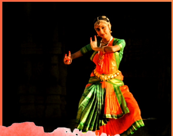
HAMPI UTSAV HAMPI - FEB. 2024