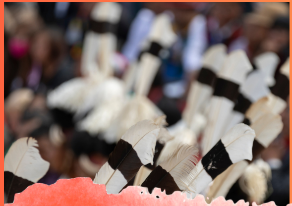
HORNBILL FESTIVAL NAGALAND - DEC. 2023