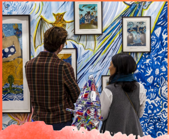
INDIA ART FAIR DELHI - FEB. 2024