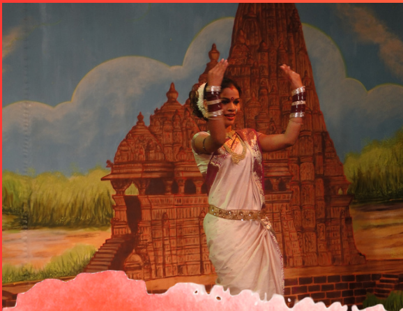
DANCE FESTIVAL KHAJURAHO - FEB. 2024