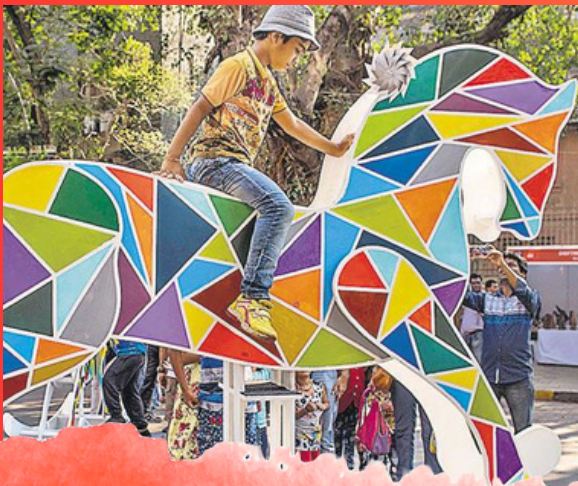
KALA GHODA FESTIVAL MUMBAI - FEB. 2024