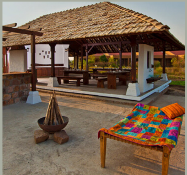
Svasara Tadoba #04

This delightful lodge is one of the first in Panna, and is unique for its delightful treehouse lounge and dining area, which overlooks the river. Enjoy lazy afternoons watching waterfowl swoop on, or gharial sunning themselves on the banks. The rooms are cozy, and have a delightful rustic charm. The food is wholesome and the service top notch.