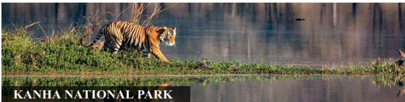
KANHA NATIONAL PARK