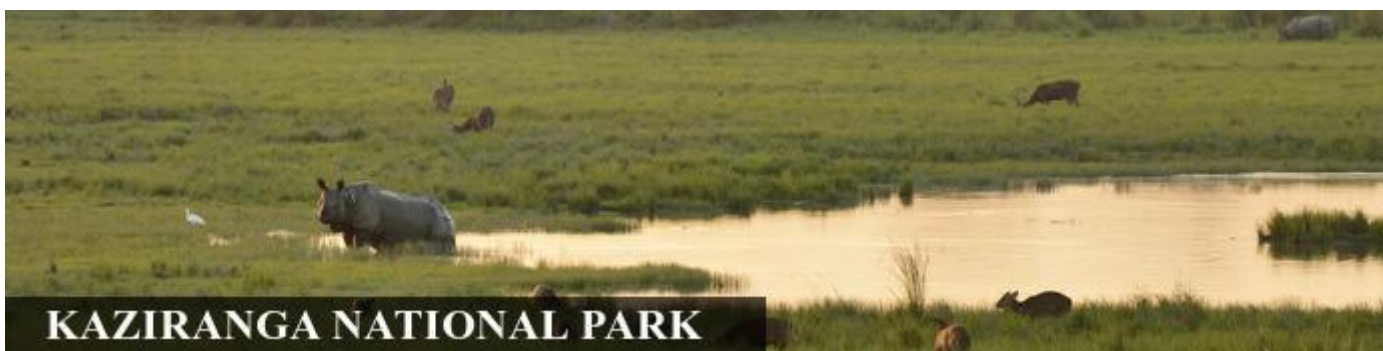
KAZIRANGA NATIONAL PARK