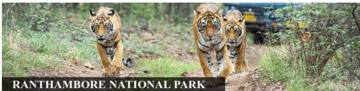
RANTHAMBORE NATIONAL PARK