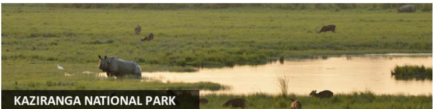
KAZIRANGA NATIONAL PARK