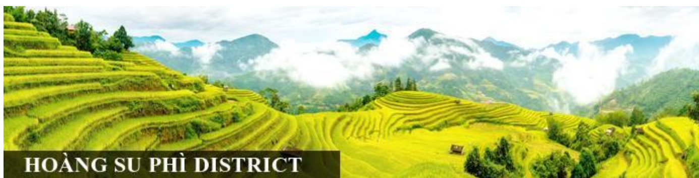
HOÀNG SU PHÌ DISTRICT