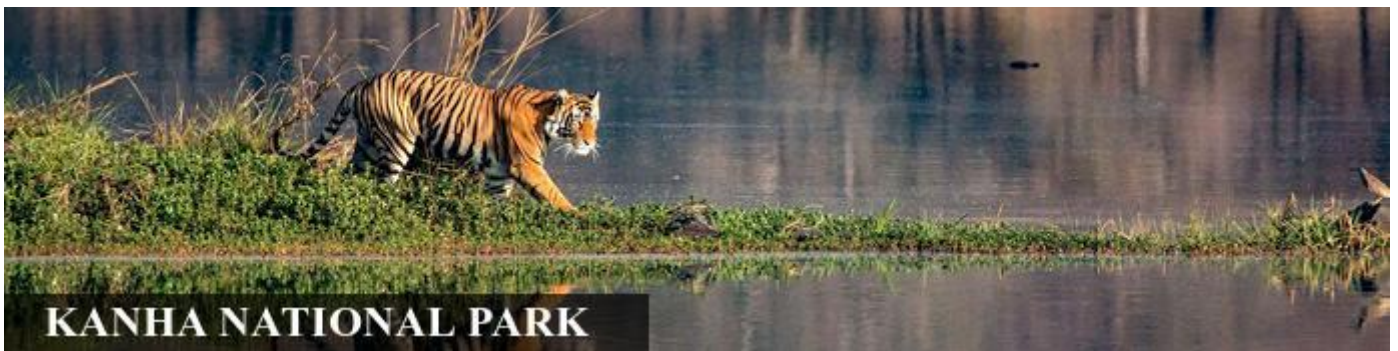
KANHA NATIONAL PARK