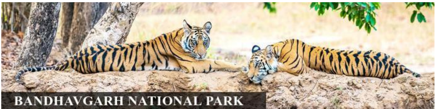
BANDHAVGARH NATIONAL PARK